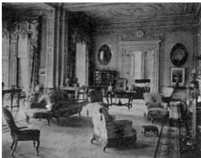
The drawing room from the 1913 Sale Catalogue